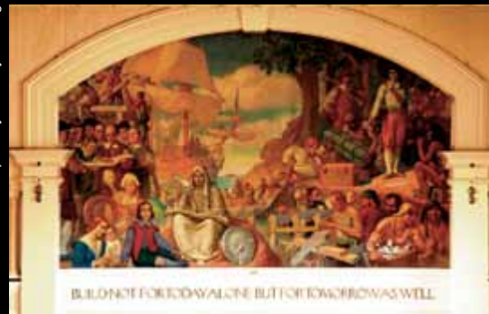
Founding of Gloucester, Charles Allan Winter ~ Gloucester Committee for the Arts