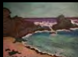
Gloucester Landscape, Milton Avery Cape Ann Museum

seARTS is a recipient of the Massachusetts Cultural Council John and Abigail Adams Arts Fund for Cultural Economic Development and also the Bruce J. Anderson Foundation - a supporting organization of the Boston Foundation.